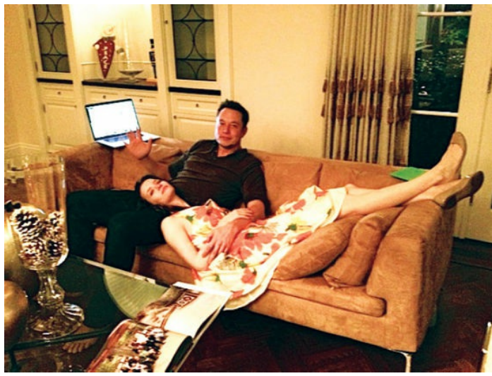
Musk and Riley relax at home in Los Angeles. Musk shares the home with his five young boys.