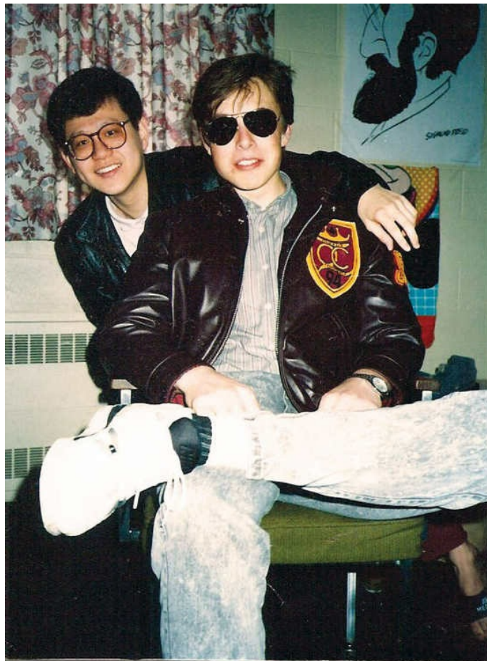
Musk ran away on his own to Canada and ended up at Queen's University in Ontario, living in a dormitory for foreign students.