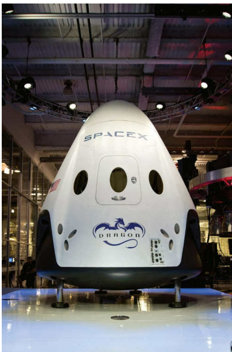
The Dragon V2 will be able to return to Earth and land with pinpoint accuracy.