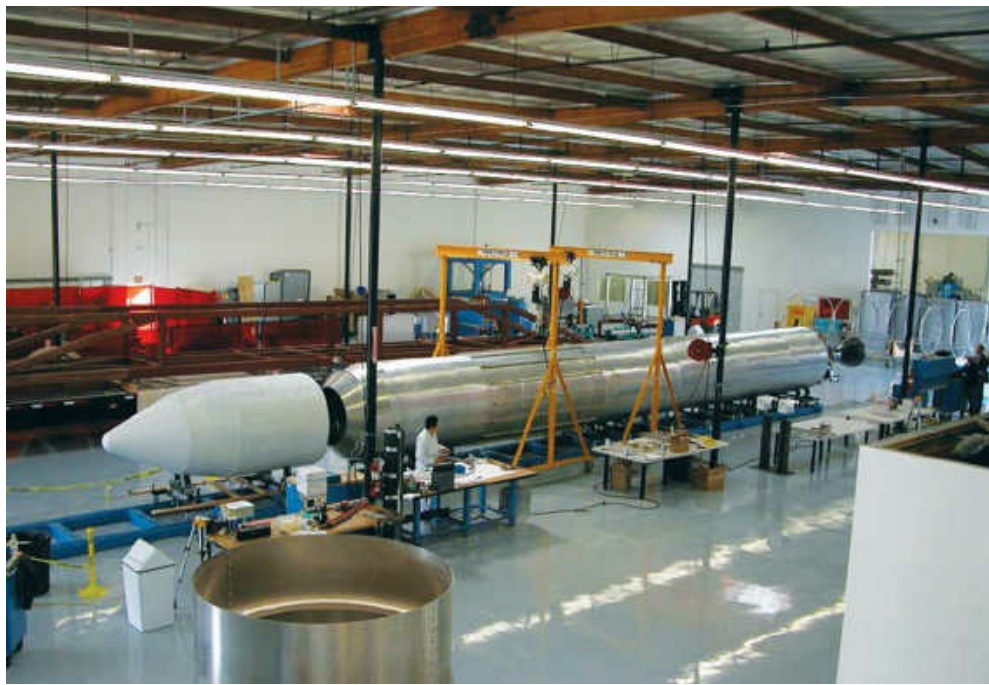
SpaceX built its rocket factory from the ground up in a Los Angeles warehouse to give birth to the Falcon 1 rocket.