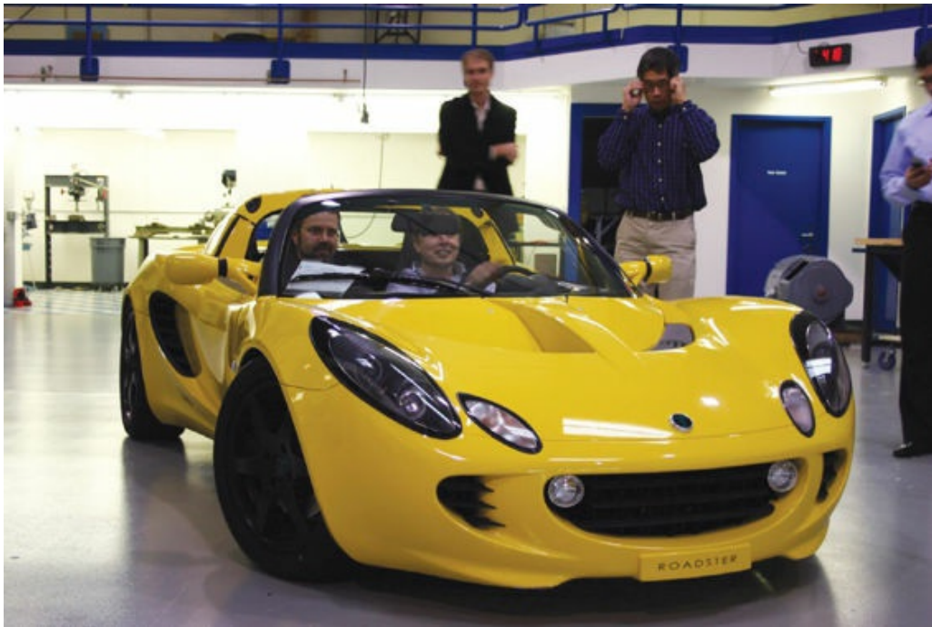
Musk and Martin Eberhard prepare to take the early Roadster for a test-drive. The relationship between the two men would fall apart in the years to come.