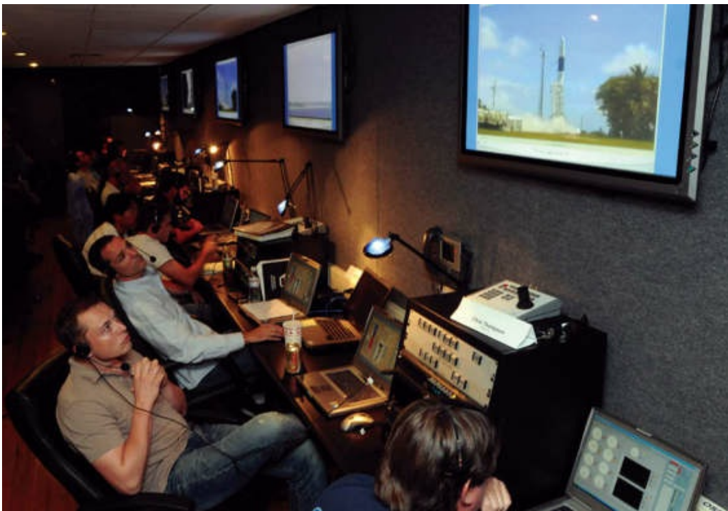
SpaceX built a mobile mission-control trailer, and Musk and Mueller used it to monitor the later launches from Kwaj.