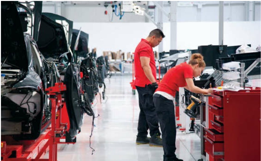
Tesla took over the New United Motor Manufacturing Inc. (or NUMMI) car factory in Fremont, California, which is where workers produce the Model S sedan.