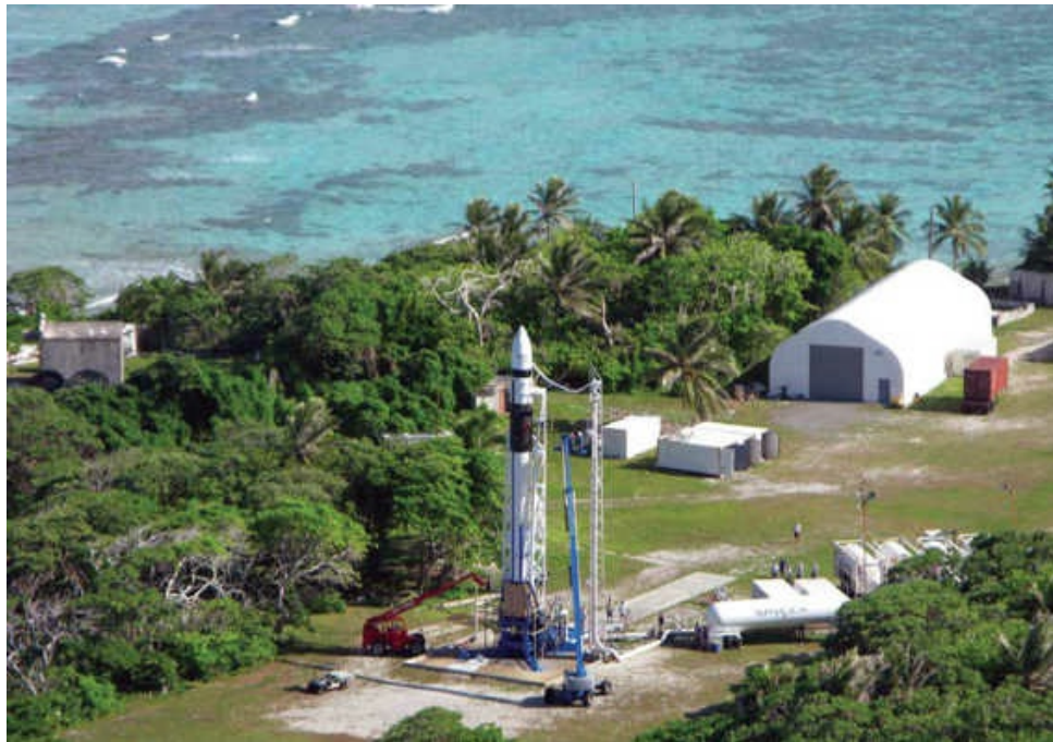
SpaceX had to conduct its first flights from Kwajalein Atoll (or Kwaj) in the Marshall Islands. The island experience was a difficult but ultimately fruitful adventure for the engineers.