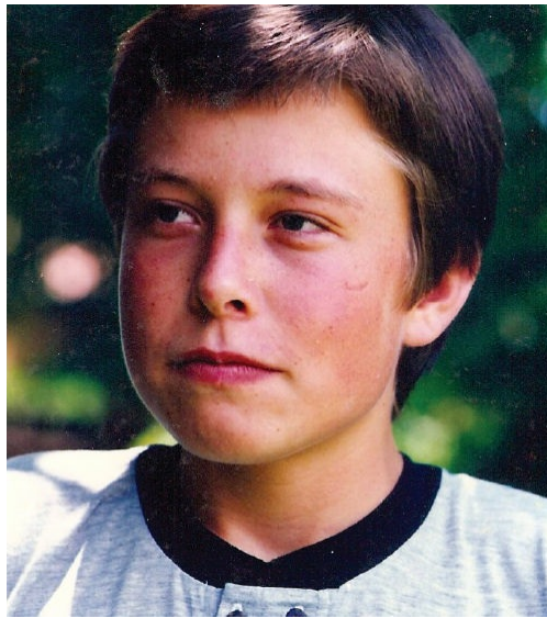
Musk was a loner throughout grade school and suffered for years at the hands of bullies.