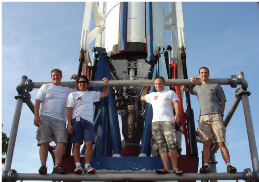
Tom Mueller ( far right, gray shirt ) led the design, testing, and construction of SpaceX's engines.