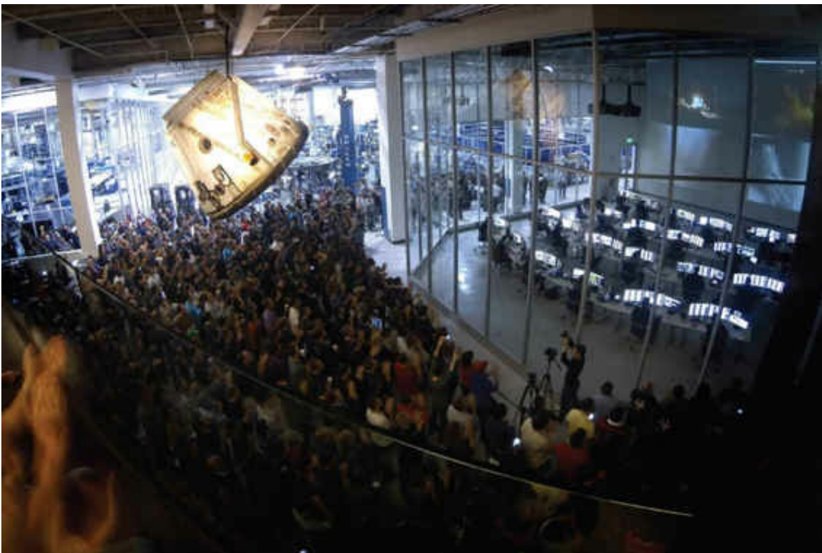
With a Dragon capsule hanging overhead, SpaceX employees peer into the company's mission control center at the Hawthorne factory.