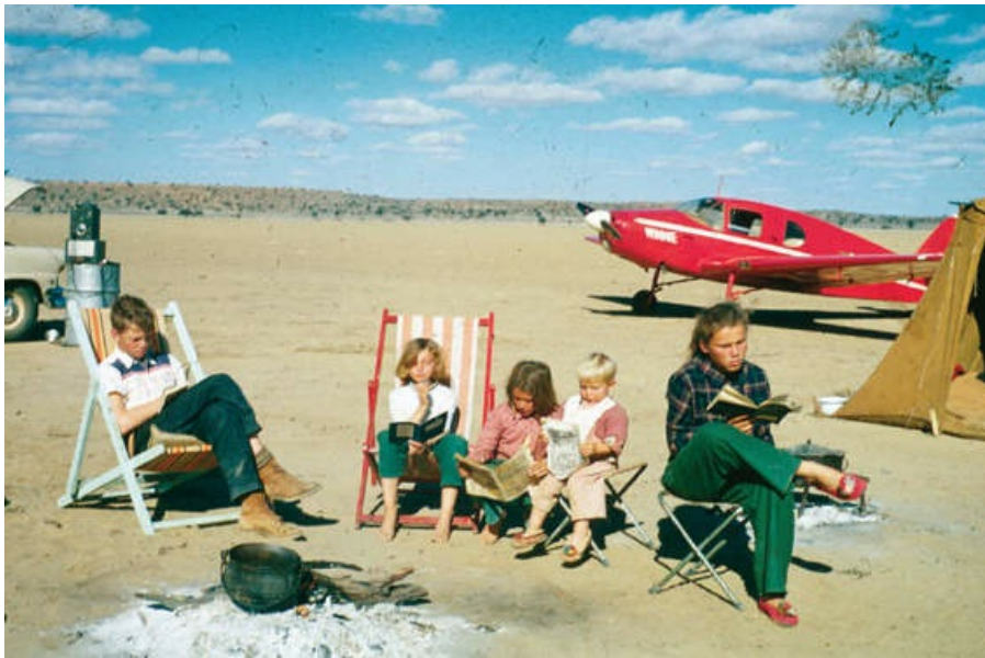
The Haldeman children had lots of downtime in the African bush while on wild adventures with their parents. © Maye Musk