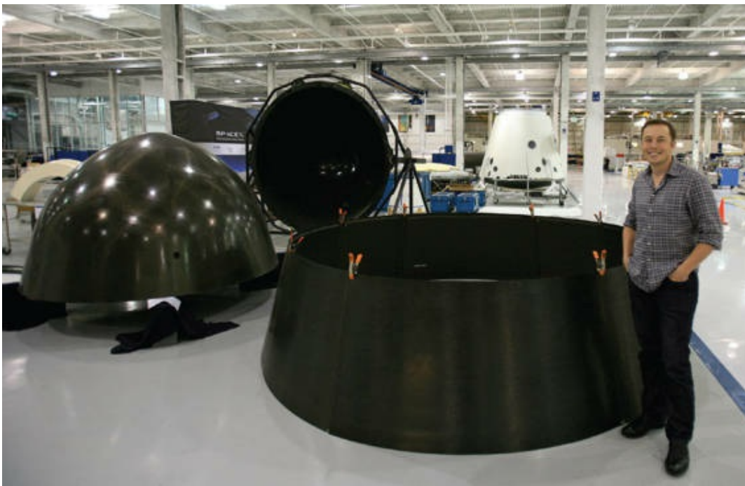
SpaceX's ambitions grew over the years to include the construction of the Dragon capsule, which could take people to the International Space Station and beyond.