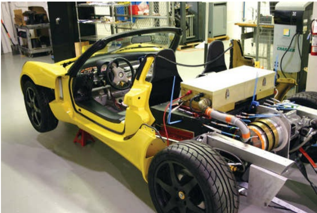
A handful of engineers built the first Tesla Roadster in a Silicon Valley warehouse that they had turned into a garage workshop and research lab.