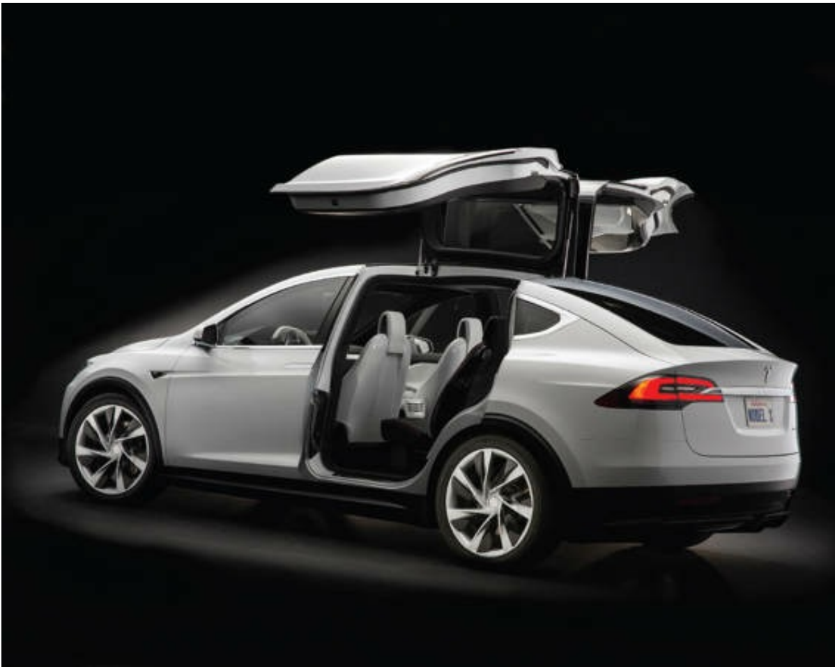
Tesla's next car will be the Model X SUV with its signature "falcon-wing doors."