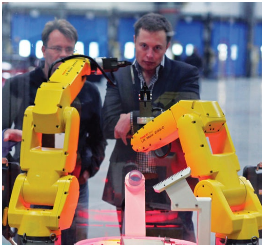
Musk has long had a thing for robots and is always evaluating new machines for both the SpaceX and Tesla factories.