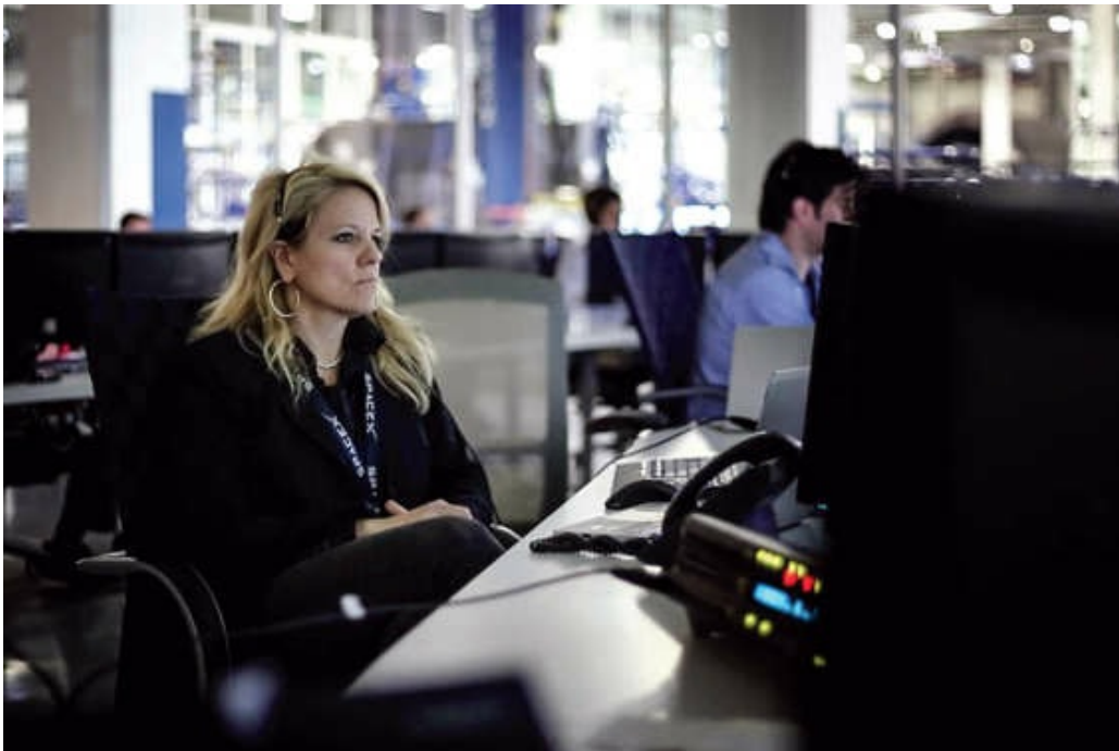
Gwynne Shotwell is Musk's right-hand woman at SpaceX and oversees the day-to-day operations of the company, including monitoring a launch from mission control.